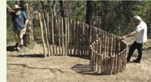
Phil Gardner 2010